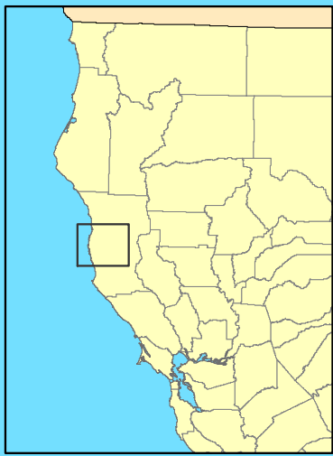
Map Figure E Stream Class, Fish Distribution, and Passage Barriers